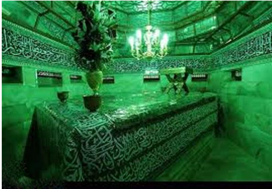
The Tomb of Lady Fatima Masuma (A)

From the tradition above, it would not be unjustified to assume that the two masked riders who appeared from nowhere, to take part in the burial ceremonies of Lady Fatima Masuma (A) were, in fact, Imam al-Ridā (A) and Imam al-Taqī (A).