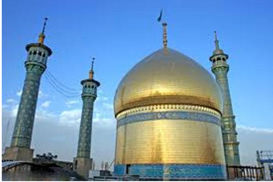
The Dome of the Shrine of Lady Fatima Masuma (A)