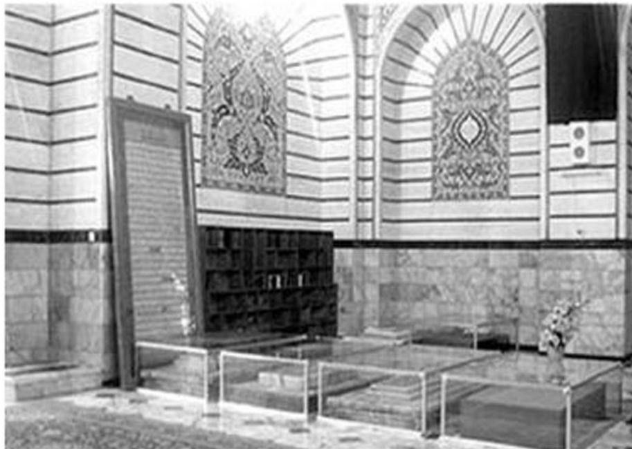
The Graves of Some Grand Ayatollahs in Masjid Bālā Sar, in the Shrine of Lady Fatima Masuma (A) in the Shrine of Lady Fatima Masuma (A) in the Shrine of Lady Fatima Masuma (A)