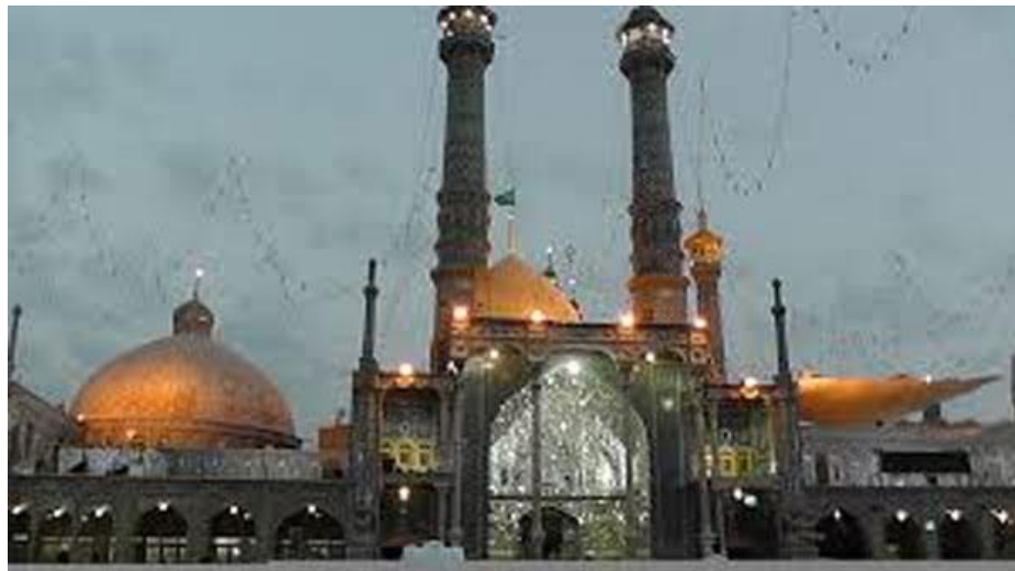
The Mirror Tiled Porch Entrance to the Shrine of Lady Fatima Masuma (A), from the New Courtyard

Lady Fatima Masuma (A) is buried in Qum, Iran. Due to her blessed presence and patronage, the city has grown into a centre of Shi`a learning; a destination for thousands of Muslim students from over 80 countries.